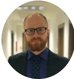
Agris Batalauskis DIRECTOR OF THE PATENT OFFICE